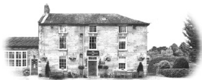
THE COACHMAN INN 1776