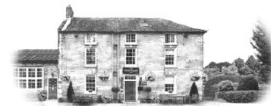
THE COACHMAN INN 1776 A Restaurant and Bar with Rooms

Six individually-designed en suite rooms (double, twin & mini suite) reflect the remarkable history of this Grade II listed Coaching Inn, with the promise of a relaxing, comfortable stay and a traditional Yorkshire welcome.